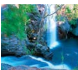
Litchfield National Park Tour Cost: $135.00

Returns: 8.30pm approximately to Darwin Hotels