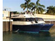
Afternoon City Sights and Sunset Harbor Cruise Cost: $145.00

Returns: 6.00pm approximately to Darwin Hotels