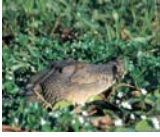
Kakadu National Park Tour Cost: $235

Highlights: • Nourlangie Rock • Yellow Water Billabong Cruise