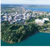
Morning Territory Wildlife Park with Cruise Cost: $150

Highlights: • Top End Wildlife • Eco Cruise