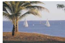
Darwin - City Sights Tour Cost: $68.00

Tour finishes at Cullen Bay 8.00pm. After the cruise there is easy access to Taxi's with is a 5 – 10 minute drive and the cost is approximately $10.00. There are also plenty of restaurants at the return point, you may wish to stay and have dinner after the cruise.