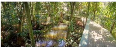
Territory Wildlife Park with Cruise and City Sights Cost: $205

To return to your hotel you can choose a short leisurely walk 10-15 minute back through the new developed Waterfront area, or Taxi back to your hotel, fare will be approximately $10.00.