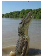
Spectacular Jumping Crocodile Cruise 'Crocodile Express' Cost: 65.00

Returns: 6.00pm approximately to Darwin Hotels